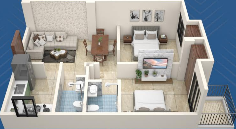
UNIT F 2 BHK SBUA 858 SQ.FT TERRACE 65 SQ.FT