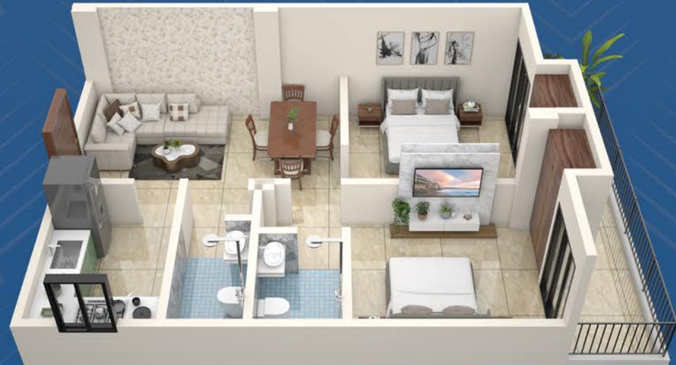
UNIT F 2 BHK SBUA 858 SQ.FT TERRACE 65 SQ.FT