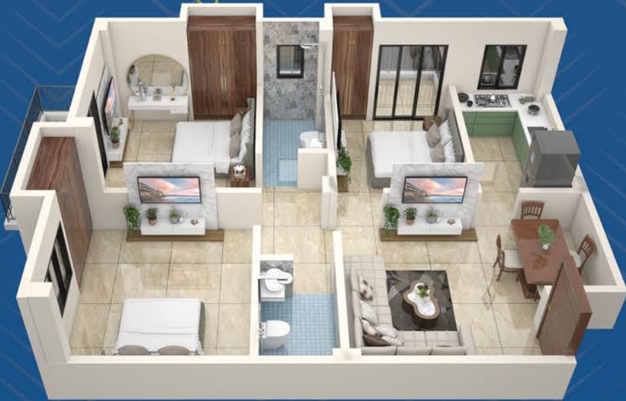
UNIT H 3 BHK SBUA 1191 SQ.FT TERRACE 81 SQ.FT