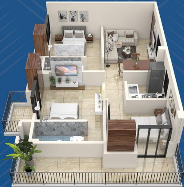
UNIT D 3 BHK SBUA 1095 SQ.FT TERRACE 87 SQ.FT