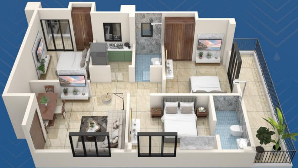
UNIT A 3 BHK SBUA 1175 SQ.FT TERRACE 56 SQ.FT