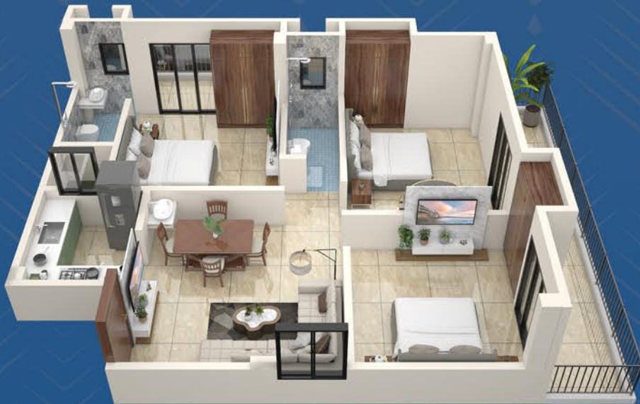
UNIT E 3 BHK SBUA 1270 SQ.FT TERRACE 116 SQ.FT