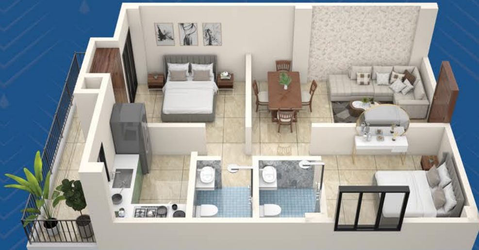
UNIT G 2 BHK SBUA 858 SQ.FT TERRACE 61 SQ.FT