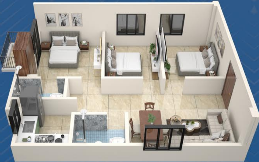
UNIT B 3 BHK SBUA 1099 SQ.FT TERRACE 75 SQ.FT