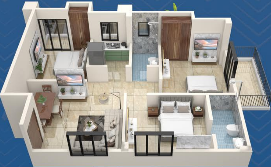
UNIT A 3 BHK SBUA 1147 SQ.FT TERRACE 88 SQ.FT