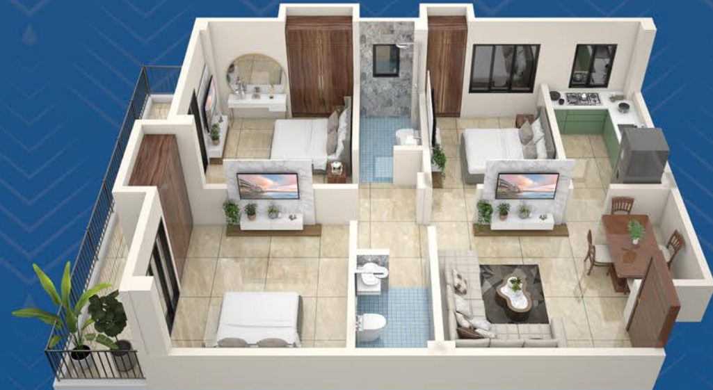
UNIT H 3 BHK SBUA 1220 SQ.FT TERRACE 60 SQ.FT