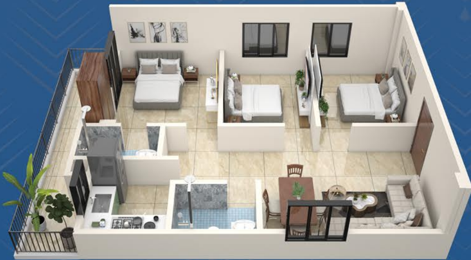
UNIT B 3 BHK SBUA 1099 SQ.FT TERRACE 75 SQ.FT