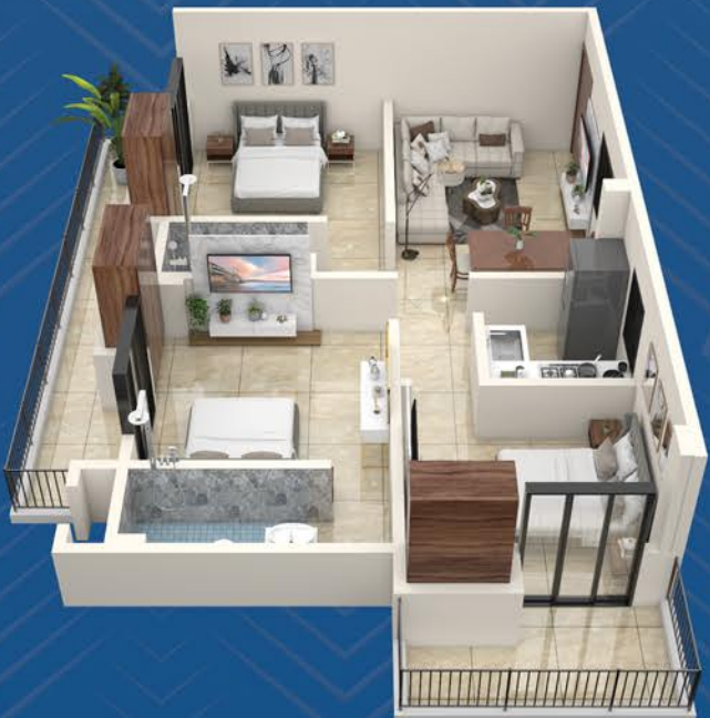
UNIT D 3 BHK SBUA 1095 SQ.FT TERRACE 75 SQ.FT