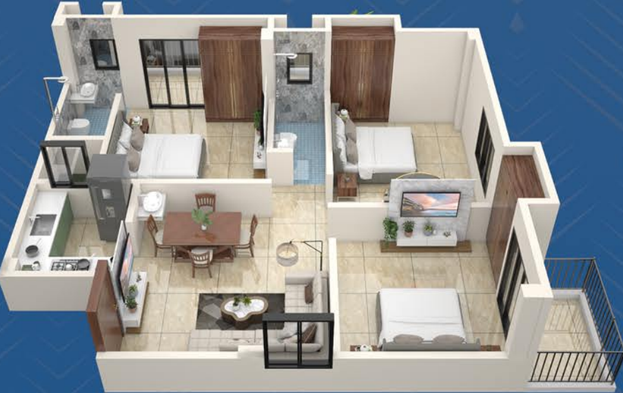
UNIT E 3 BHK SBUA 1270 SQ.FT TERRACE 75 SQ.FT