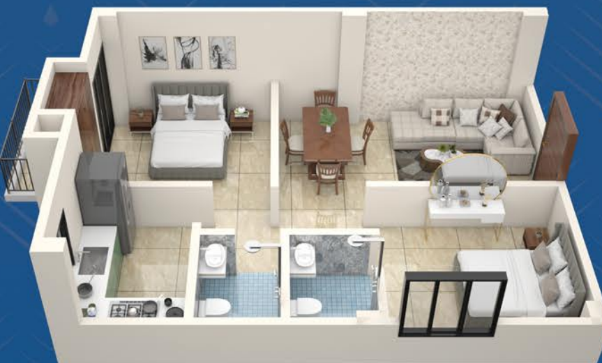
UNIT G 2 BHK SBUA 858 SQ.FT TERRACE 61 SQ.FT