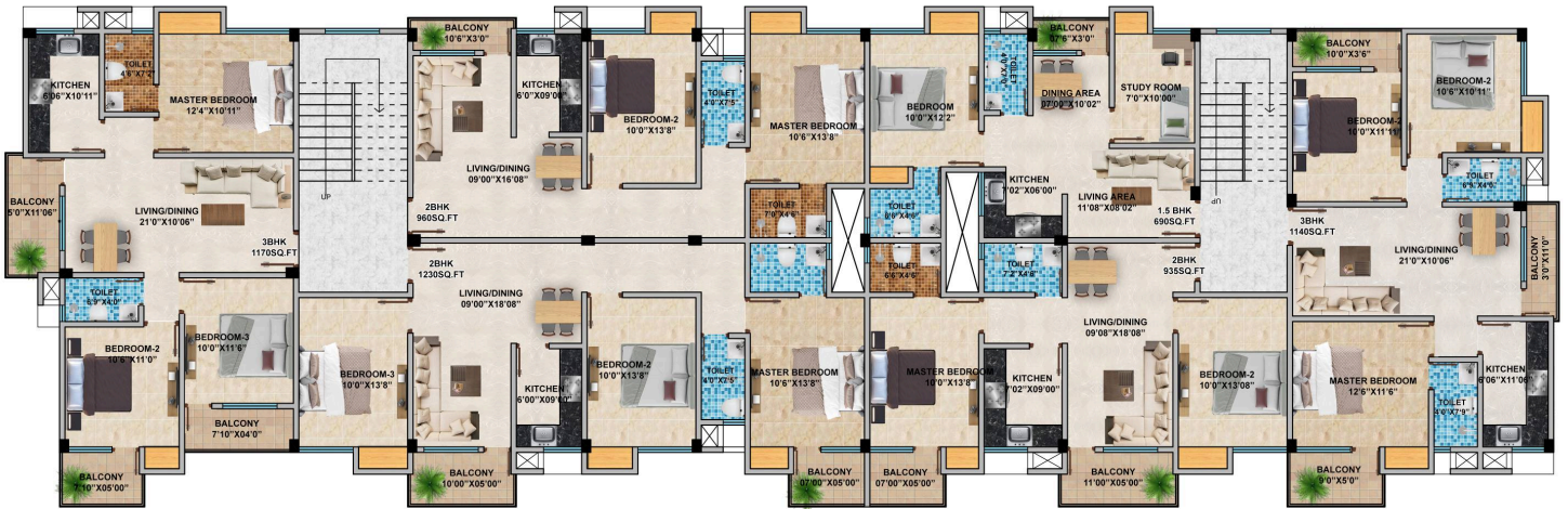
PROPOSED 1ST- 2ND FLOOR PLAN