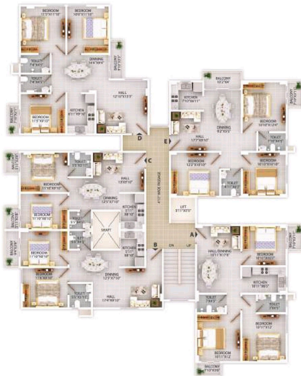
Typical 1st to 3rd Floor