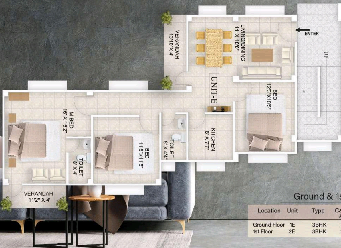
Ground & 1st Floor